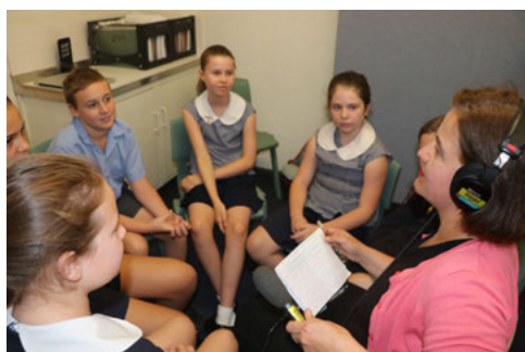
Wonder what the topic is?