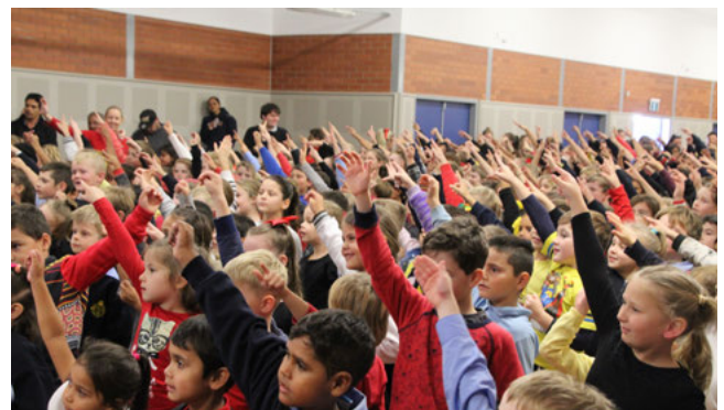
Enthusiasm + engagement = learning