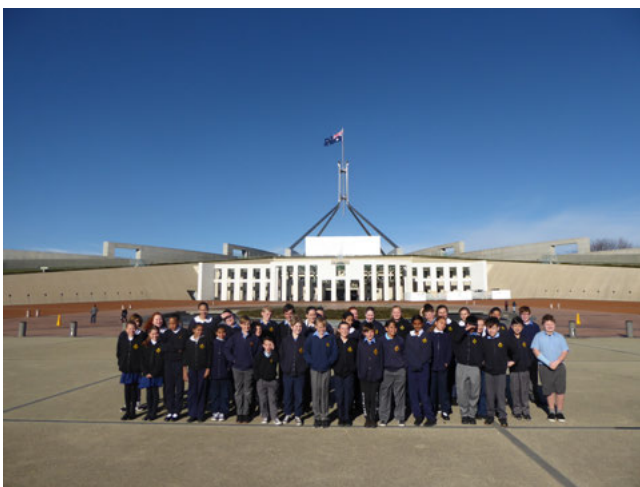
Year 6 visiting Parliament House