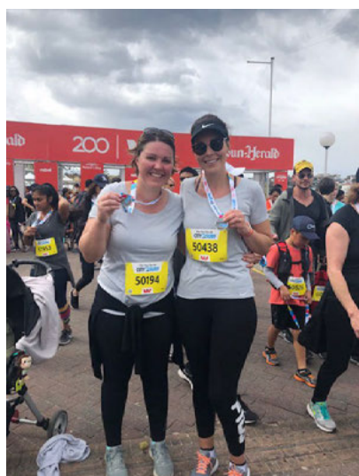
Mrs Black and her sister enjoy a special moment – fantastic work ladies!

Be inspired - set goals and be amazed at what you can achieve through hard work and determination!! Congratulations to Mrs Black and her sister who braved not only the weather, the undulating roads, a huge crowd and quite possibly their own small moments of self-doubt, to complete the famous City to Surf!