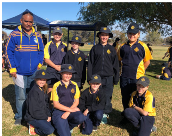
Team 3 looking rather chuffed with their effort