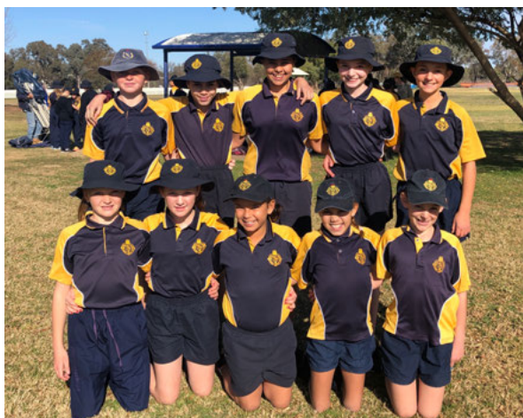
Team 1 enjoyed their experience on the touch field