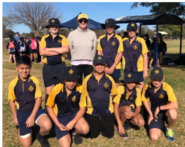
Open boys touch team – also played at Narrabri the previous day.