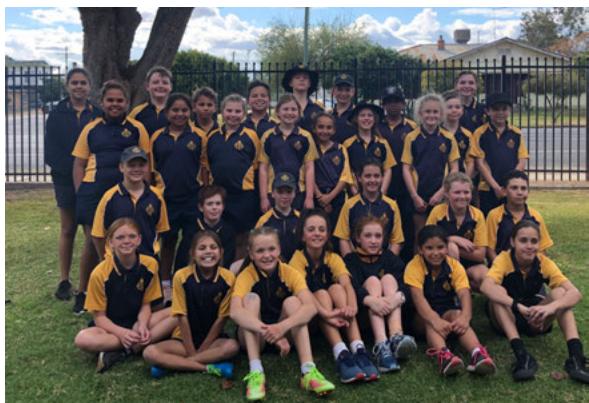
Preparing to leave for the Gala Day

Touch Football Gala: Enthusiasm was high as the students played five energetic games. Many students were having their first experience in this team sport and team managers were most impressed. Well done!