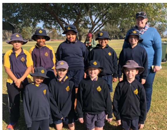
Team 2 played well