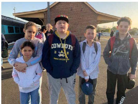
Ready for an early departure

Sydney and fun at the beach proved to be a wonderful experience for students who joined with many other students from around our district for two weeks at Stewart House. The group agreed that special highlights included visiting Taronga Zoo, swimming at the Homebush Olympic Centre, a ferry ride and meeting new people. They were amazed by the number of stairs! The co-ordinators have been most complimentary about the presentation, good manners and friendliness of MPS group. Well done!