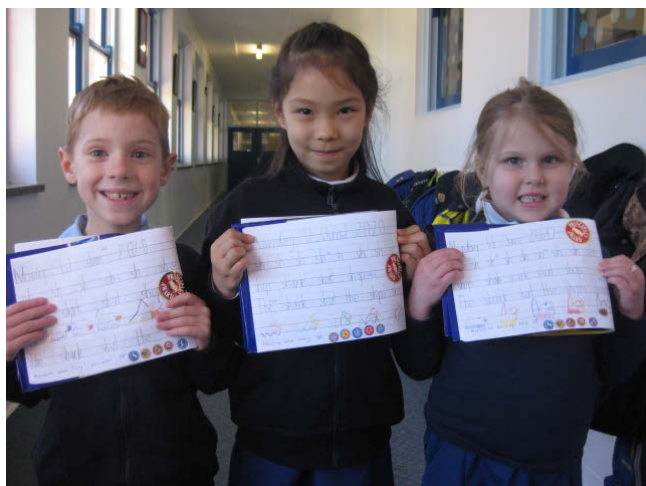
Congratulations - beautiful bookwork ...

In addition to a written report, parents are being offered an opportunity to have a conversation with class teachers about their child's learning achievements for all of Semester 1 and to develop goals for Semester 2. The phone call will replace the usual parent/teacher interviews conducted at the beginning of Term 3. Teachers have allocated times they will be available before or after school during Weeks 8 and 9 (Monday 15 th to Friday 26 th June). To book a ten minute timeslot parents are asked to contact the school office by COB Friday, 5 th June. Teachers will ring parents on the phone number nominated. We do hope you will take this opportunity to share the education journey for your child during 2020.