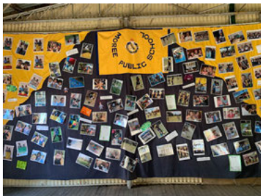
Moree Show – MPS sharing the great news!