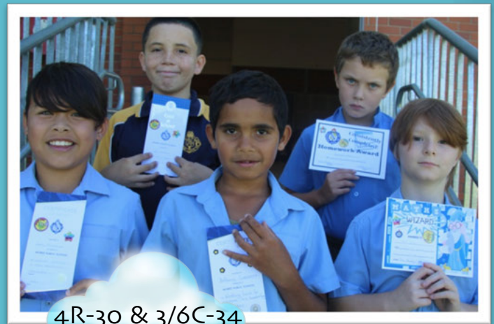
4R-30 & 3/6C-34