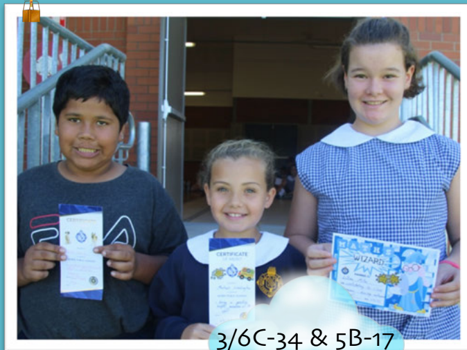
3/6C-34 & 5B-17