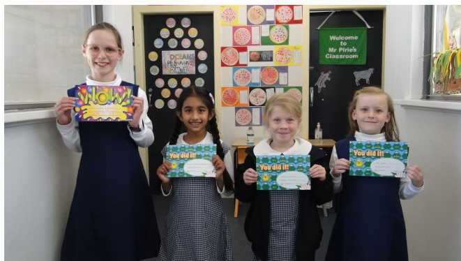
Reading opens up an exciting world ....

Please keep a look-out on our Facebook page for updates!